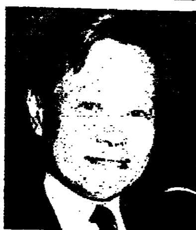
One of the famous participants at the symposium, Nobel Laureate Chen N. Yang.

By PHILIP GILLON/Jerusalem Post Reporter